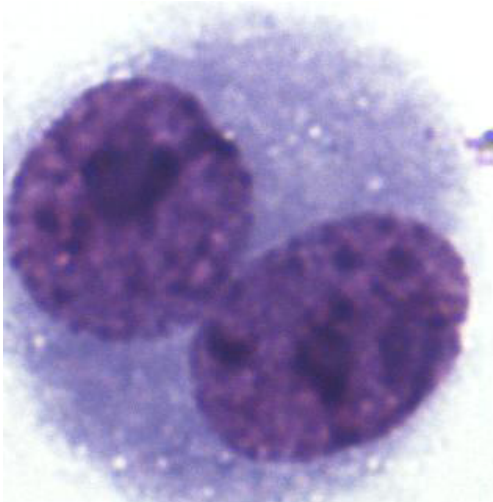
Figure 1. Binucleated cell (BNC) of blue fox; Giemsa staining.

before transformation. The % BNC is a normally distributed trait. The PROC GLM (SAS, 2014) was used to perform analysis of variance, accounting, in the model, for animal species and sex analysed within animal species. Significant differences between the species were tested with the Tukey–Kramer test. Differences in the sex within species were analysed using Student’s t test.