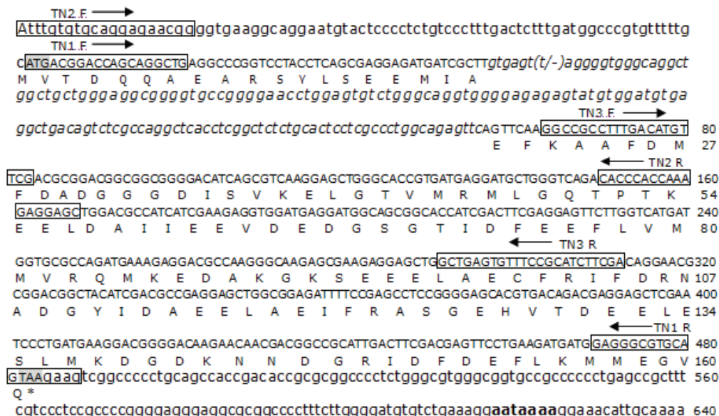
Fig. 1: Nucleic acid sequence and predicted amino acid sequence of sheep TNNC2 gene

The strategies for amplified the sequence of sheep TNNC2 gene were summarized in Figure 1. The resultant sequencing indicates that the full length cDNA of TNNC2 is 483 bp and contains an open reading frame (Figure 1). The sequence was submitted to GenBank (GenBank accession no. EU239357).